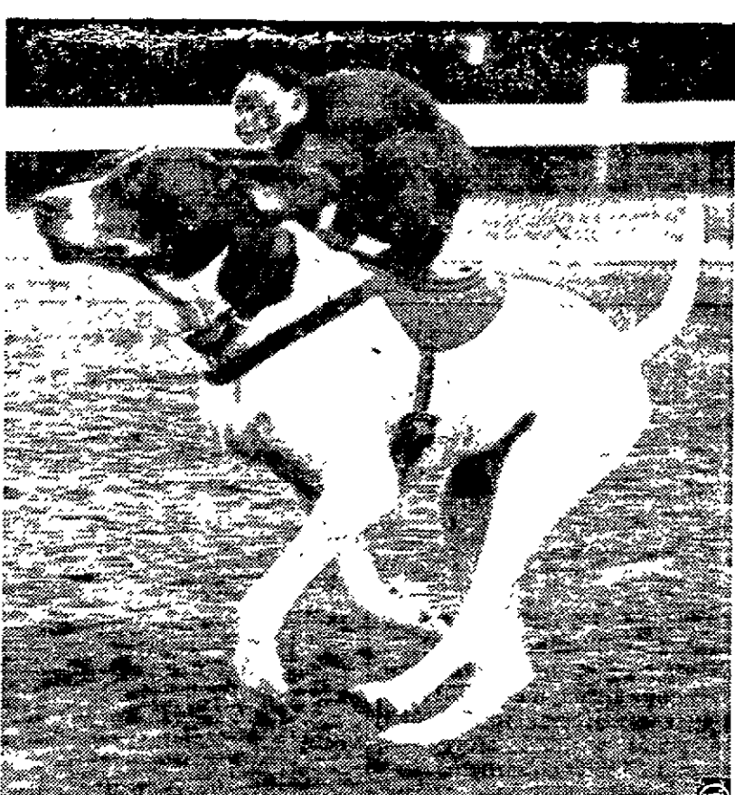
MONKEY BUSINESS —Mickey seems right at home in the saddle guiding his mount, Rex, around the turf at Pinehurst, N. C. Pets of trainers at Newport Stock Farm Stables, a special saddle was built for the monkey.