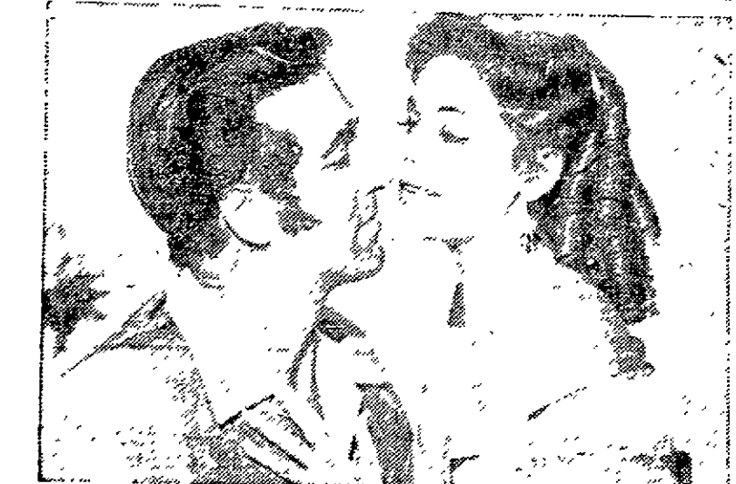
John Payne makes love to Arlene Dahl in this scene from "Caribbean," released by Paramount, in color by Technicolor, which will open Sunday, February 15, for three days at the Paramount Theatre.