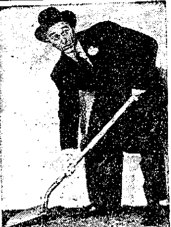
DIGBY O'DELL, the friendly undertaker is out of this world when using the layaway plan. He is heard on the NBC "Life of Riley" program tonight at 10.