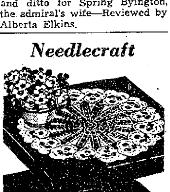
By LAURA WHEELER

Here it is! A sunburst of pansies to make a bower of your table. Give a set of these dollies to a bride or to yourself!