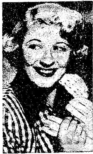
"LEAVE IT TO JOAN", starring Joan Davis as the zaniest salesgirl in Willock's Department Store, is back on the air Monday nights on WPAJ-CBS at 10 p.m.

Papa's sent the most expensive one. There is a tender scene between Grandpa and a 14-year-old lad who always has had a crush on the bride and is hurt and bewildered by her plunge into matrimony with someone else.