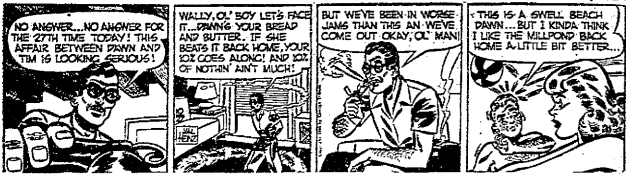
TERRY AND PIRATES DON'T FORGET THE BASKET OF FRUIT