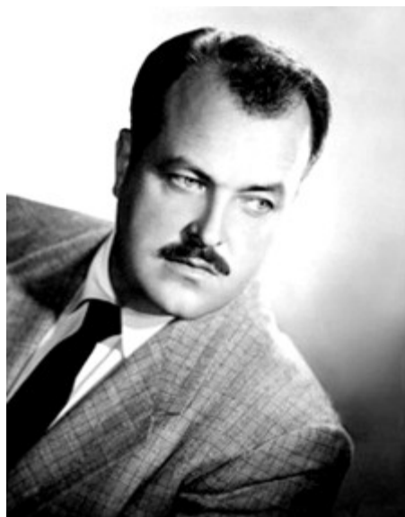
William Conrad, ca. 1943

1944 The Whistler 1945 Destination Tomorrow 1946 Dark Venture 1946 Strange Wills 1946 I Deal In Crime 1946 Favorite Story 1946 Cavalcade Of America 1946 Meet Miss Sherlock 1947 Voyage Of the Scarlet Queen 1947 The Adventures Of Philip Marlowe 1947 Johnny Madero, Pier 23 1947 Mr President 1947 Escape 1947 Lux Radio Theatre 1947 Shorty Bell, Cub Reporter 1948 The New Adventures Of Michael Shayne 1948 Damon Runyon Theatre 1948 The First Nighter Program 1948 Ellery Queen 1948 The Adventures Of Sam Spade 1948 Let George Do It 1948 Jeff Regan, Investigator 1948 Hallmark Playhouse 1948 Yours Truly, Johnny Dollar 1948 Prudential Family Hour Of Stars 1948 Command Performance 1948 Hawk Larabee 1949 Pat Novak For Hire 1949 Our Miss Brooks 1949 This Is Your FBI 1949 Hollywood Mystery Playhouse 1949 Rocky Jordan 1949 Screen Director's Playhouse 1949 Box Thirteen 1949 The Green Lama 1949 Dangerous Assignment