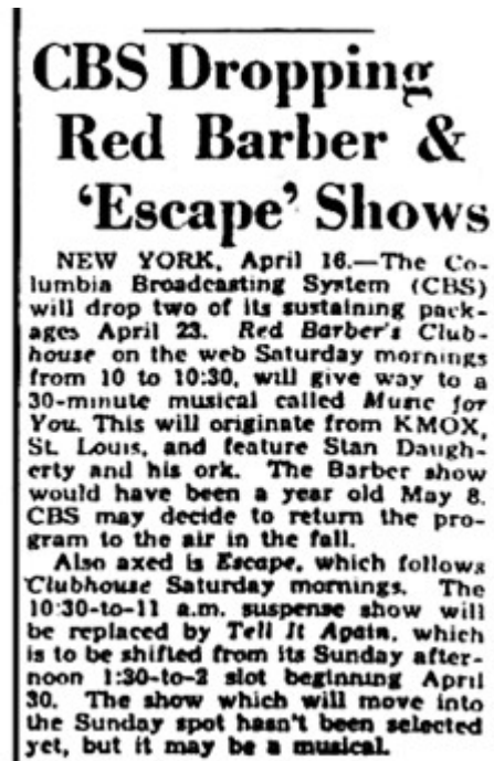
The Billboard of April 23rd 1949 announces the cancellation of Escape