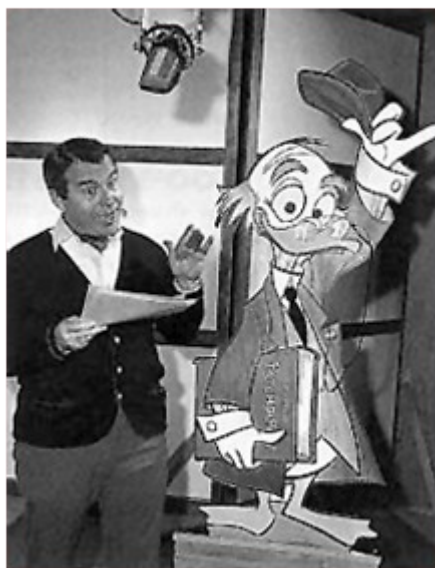
Paul Frees with one of thousands of alter egos, Ludwig Von Drake, ca. 1953

1949 The Adventures Of Frank Race 1949 The Green Lama 1949 Richard Diamond, Private Detective 1949 Four Star Playhouse 1949 The Croupier 1949 California Caravan 1949 Crime Correspondent 1950 T-Man 1950 A Day In the Life Of Dennis Day 1950 Dangerous Assignment 1950 The Line-Up 1950 Tales Of the Texas Rangers 1950 Presenting Charles Boyer 1950 This Is Your F.B.I. 1950 The Story Of Dr Kildare 1950 The Adventures Of the Saint 1951 Short Story 1951 The Adventures Of Sam Spade 1951 Night Beat 1951 The Whisperer 1951 Romance 1951 Wild Bill Hickok 1951 Mr Aladdin 1951 Broadway Is My Beat 1951 This Is the story 1951 The Silent Men 1952 Hollywood Star Playhouse 1952 The Black Book 1952 The Pendleton Story 1952 I Confess 1953 Gunsmoke 1953 On Stage 1953 Confession 1953 Crime Classics 1953 Mr President 1954 That's Rich 1954 The Edgar Bergen Show 1954 Rocky Fortune 1954 Fibber McGee and Molly 1954 Hallmark Hall Of Fame 1956 NBC Radio Theatre 1956 You Were There 1956 Yours Truly, Johnny Dollar 1956 Those Young Bryans 1957 CBS Radio Workshop 1957 Heartbeat Theatre