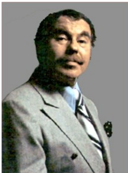
Paul Frees, ca. 1975

working with an unprecedented nine of the major animation production companies of the 20th century: Walt Disney Studios, Walter Lantz Studios, UPA, Hanna-Barbera, Filmation, MGM Studios, DePatie-Freleng Enterprises, Jay Ward Productions and Rankin/Bass . His work with the Walt Disney Studios led to a long collaboration with them, from voicing animated characters to recordings that brought some of the most compelling attractions at both Disneyland and Disney World to life.