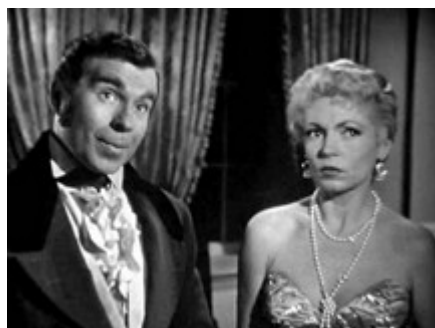
Paul Frees as Etienne in The Adventures of Jim Bowie (1957)