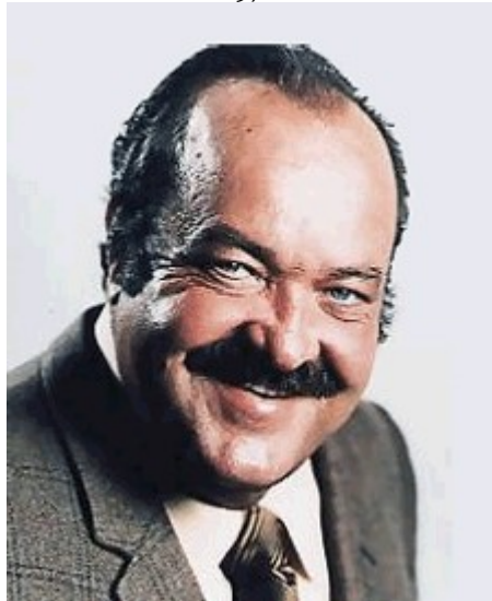
Bill Conrad, ca. 1972