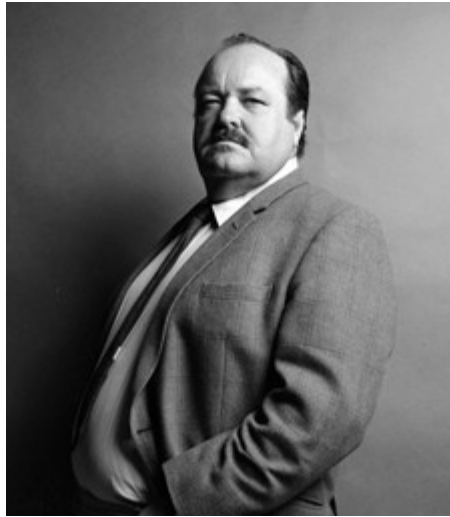
Conrad in Cannon publicity still, ca 1971