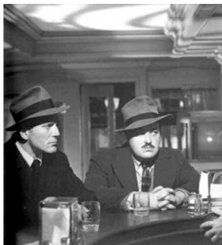
William Conrad in Killers (1947)

William Conrad was born William Cann in Louisville, Kentucky. He started work in radio in the late 1930s in California. During World War II, Conrad served as a fighter pilot. He returned to the airwaves after the war, going on to accumulate over 7,000 roles in radio--by his own estimate. We can attest to at least 2,000-- Conrad had been a fighter pilot, after all.