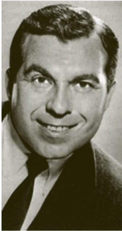
Paul Frees, ca. 1952

1945 Lux Radio Theatre 1945 Maxwell House coffee Time 1946 Rogue's Gallery 1946 The Whistler 1946 The Casebook Of Gregory Hood 1946 The Alan Young Show 1946 Suspense 1947 Escape 1947 The Voyage Of the Scarlet Queen 1947 Ellery Queen 1948 Studio X 1948 The Player 1948 Your Movietown Radio Theatre 1948 The First Nighter Program 1948 Family Theatre 1948 Let George Do It 1948 The Eternal Light 1948 Jeff Regan, Investigator 1948 NBC University Theatre 1948 The Railroad Hour 1949 The Adventures Of Philip Marlowe 1949 Prowl Car 1949 Screen Director's Playhouse 1949 The Prudential Family Hour Of Stars 1949 Rocky Jordan 1949 Pat Novak For Hire 1949 Special Care Program 1949 Box 13