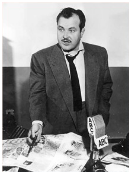
William Conrad, for ABC, ca. 1957