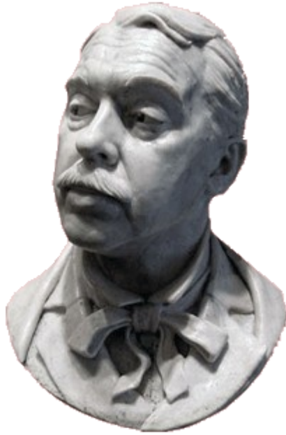
Bust of Paul Frees "The Man of A Thousand Voices" circa 1978