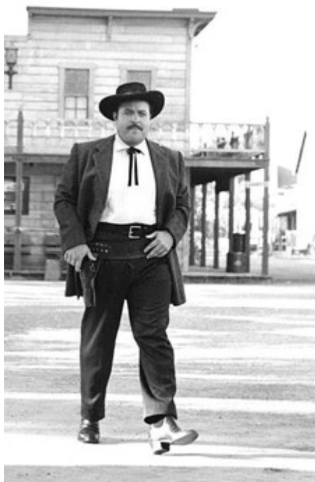
William Conrad as Matt Dillon, ca. 1953

1949 Richard Diamond, Private Detective 1949 Four Star Playhouse 1949 The Adventures Of the Saint 1949 The Count Of Monte Cristo 1950 Dragnet 1950 The Halls Of Ivy 1950 The Adventures Of Frank Race 1950 Night Beat 1950 Rocky Jordan 1950 T-Man 1950 Philip Morris Playhouse 1950 The Adventures Of Sam Spade 1950 The Story Of Dr Kildare 1950 Romance 1950 Broadway Is My Beat 1950 Hollywood Star Playhouse 1951 Hedda Hopper's Hollywood 1951 The Man Called X 1951 Tales Of the Texas Rangers 1951 Pete Kelly's Blues 1951 Mr I.A. Moto 1951 The Silent Men 1951 The Railroad Hour 1952 Gunsmoke 1952 Stars Over Hollywood 1952 The Line-Up 1952 Jason and the Golden Fleece 1952 Tums Hollywood Theatre 1953 Bakers' Theatre Of Stars 1953 The Six-Shooter 1953 Crime Classics 1953 On Stage 1953 Hallmark Hall Of Fame 1953 Fibber McGee and Molly 1954 High Adventure 1955 The Adventures Of Captain Courage 1955 I Was A Communist For the FBI 1955 Mystery Theatre 1956 The Key 1956 CBS Radio Workshop 1958 Heartbeat Theatre Bold Venture The Clock Secret Mission The Roy Rogers Show The Pendleton Story The Adventures Of Maisie At Ease Safari Obsession Peril