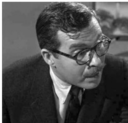
Paul Frees in The Shaggy Dog (1978)