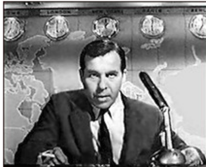
Paul Frees, ca. 1949