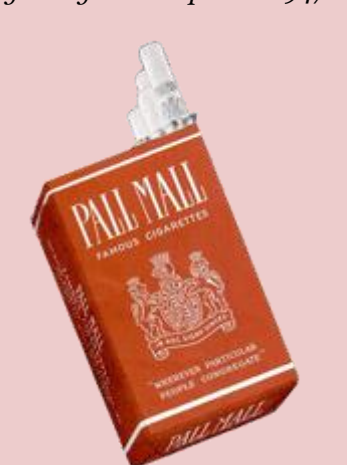
Initially sponsored by American Tobacco's Pall Mall brand, the series ultimately switched to Lucky Strike for the last two years of the canon